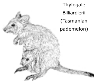
Thylogale billiardieri (Tasmanian pademelon)

For details on the above tours please visit the INALA website at www.inalabruny.com.au or contact INALA directly to customize a tour of Tasmania or any other part of Australia that will suit your particular needs.